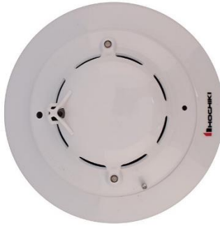
Shown With Trim Ring