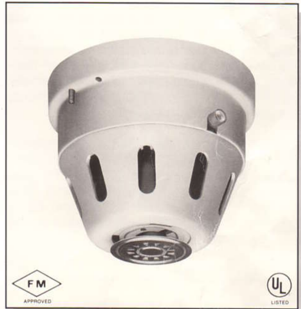
Pictured is MODEL SLG-24FH

The unit is comprised of a LED light source and silicon photo diode receiving element. Normally, the receiving element receives no light from the pulsating light source. In the event of fire, smoke enters the detector and light is reflected from the smoke particles to the receiving element, where it is converted