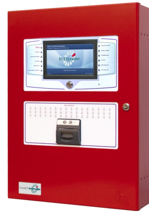
Double Aperture Includes Zone LED Module and Printer