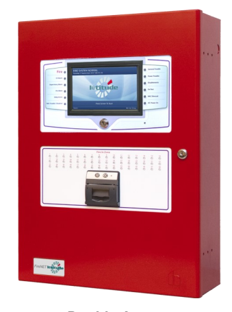
Double Aperture Includes Zone LED Module and Printer