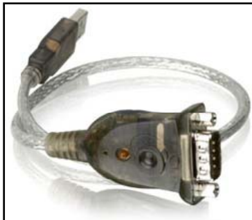
Manufacturer: IO Gear Model GUC232A (HA Part# 0100-04570)

As per the FireNET installation and operation manual, Section 9.1 PC Requirements, Loop Explorer software requires a serial communication port that can be configured as COM 1-8. Due to increased difficulty in locating laptop PCs with true serial ports, Hochiki America Corp. has tested and recommends the following USB to Serial converter: