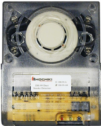
Duct housing with an ALK-D digital analog photoelectric sensor.